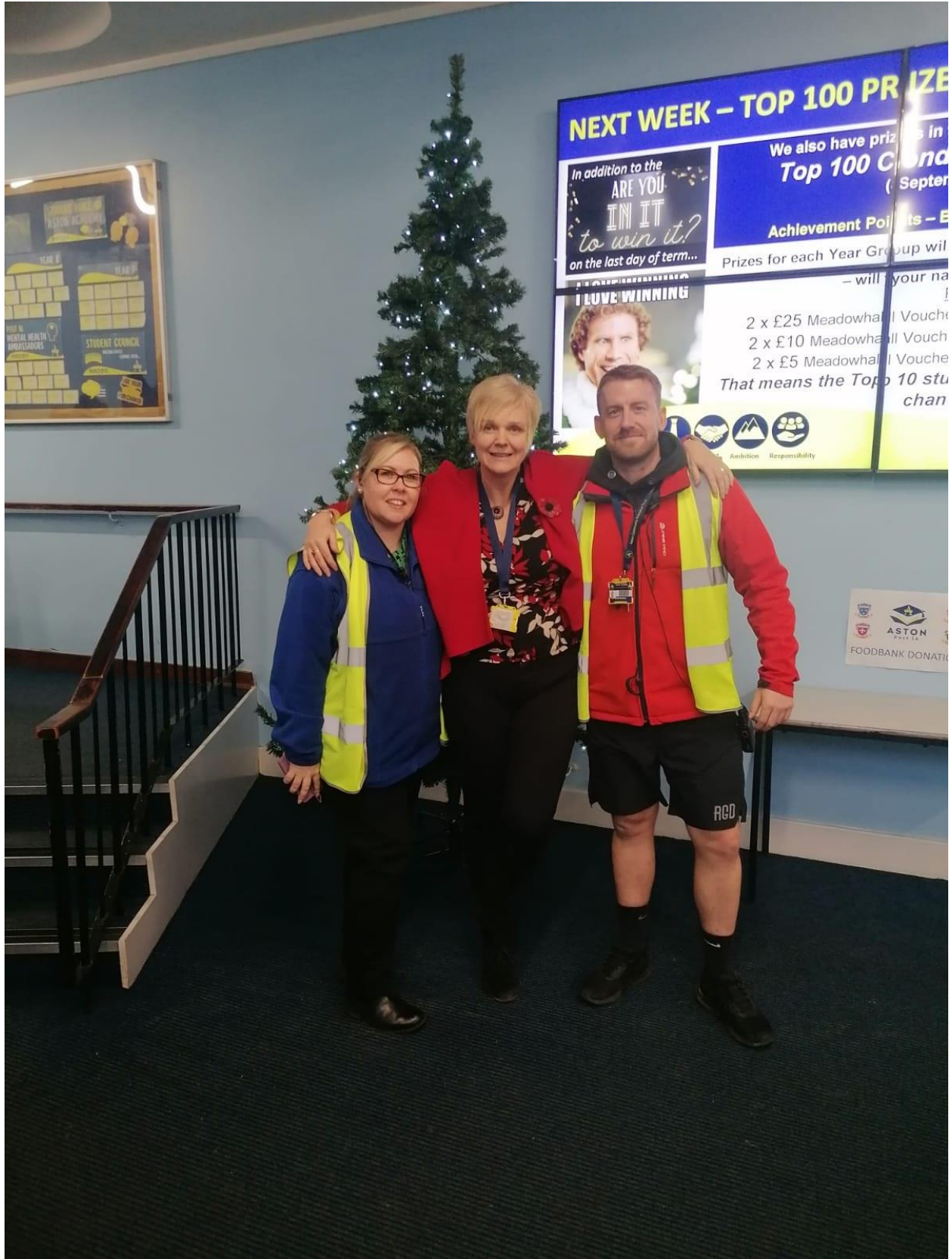
The Year team wish everyone a Happy Easter!